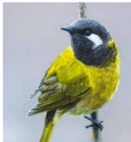
White-eared Honeyeater by Geoffrey Carran, winner of The Peoples' Choice Award at Wild Thing