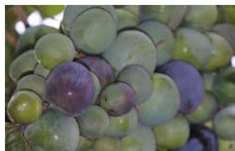
Ormeau Bottle Tree ( Brachychiton sp.). Small Leaved Tamarind ( Diploglotis campbellii ). Mullumbimby Davidson's Plum ( Davidsonia jerseyana )