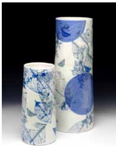
Tangled up by Mollie Bosworth, featured at Artisans in the Gardens