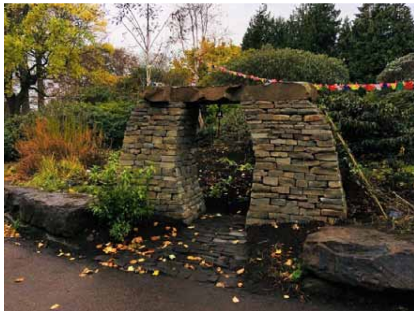
The Nepalese Gate