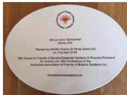
Our best wishes go to Friends of Benalla and Riverine Parkland as they adapt to change and look to their future survival. A plaque to commemorate the 2018 Benalla Conference will soon be installed at the Gardens.