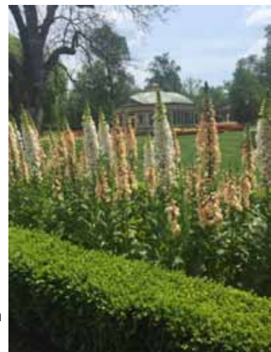
Spring splendour in my home Ballarat Botanical Gardens